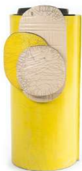
Kiki van Eijk, Very Large Raku Yellow Vase #4 , 2024