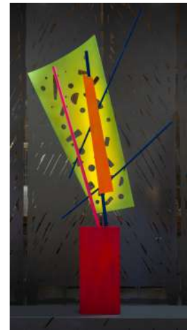
Joost van Bleiswijk, Tinkered , 2024, Courtesy of the Artists & Spazio Nobile