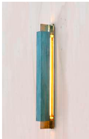
Joost van Bleiswijk, Brass bar M , 2023, Courtesy of the Artists & Spazio Nobile