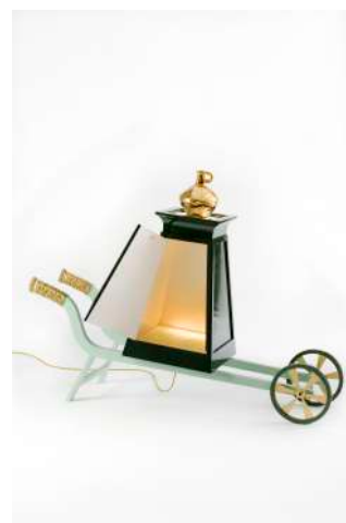
Kiki van Eijk, Cut & Paste Cabinet Cart , 2010