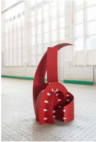
Joost van Bleiswijk, Curved and Taped , 2019, Courtesy of the Artists & Spazio Nobile