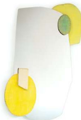
Kiki van Eijk, Ceramic Wall Story , 2024, Courtesy of the Artists & Spazio Nobile