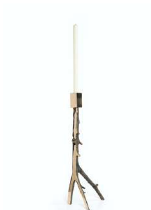
Kiki van Eijk, Civilized Primitives , 2016, Courtesy of the Artists & Spazio Nobile