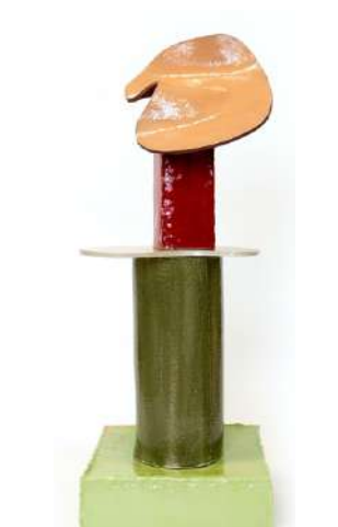
Kiki van Eijk, Garden Rush , 2022, Courtesy of the Artists & Spazio Nobile