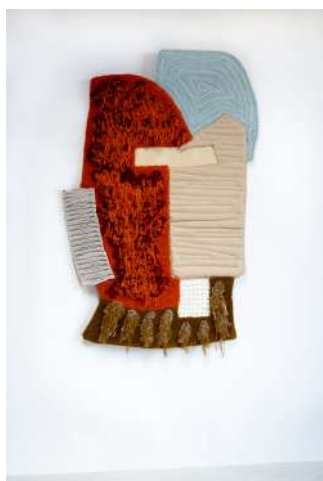
Kiki van Eijk, Textile Collage Sketch , 2022, Courtesy of the Artists & Spazio Nobile