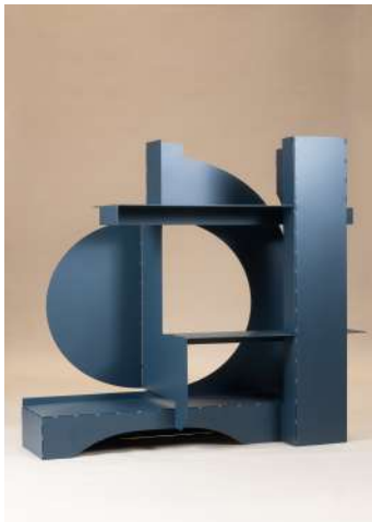
Joost van Bleiswijk, One Sheet Console , 2024, Courtesy of the Artists & Spazio Nobile