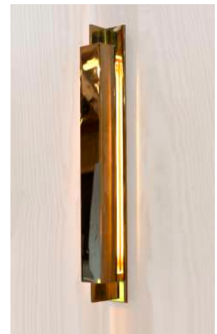
Joost van Bleiswijk, Brass bar L , 2022, Courtesy of the Artists & Spazio Nobile