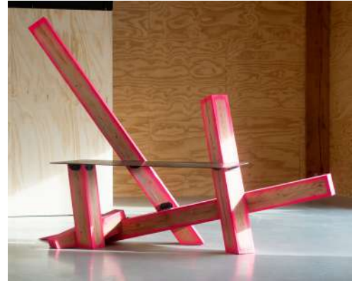
Joost van Bleiswijk, Beam Sketch Desk , 2023, Courtesy of the Artists & Spazio Nobile