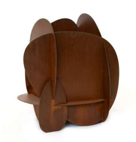
Joost van Bleiswijk, Interlocking Planter M , 2022, Courtesy of the Artists & Spazio Nobile