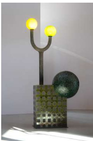
Kiki van Eijk, Sprout 01 , 2024, Courtesy of the Artists & Spazio Nobile