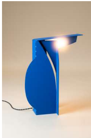
Joost van Bleiswijk, One Sheet Table Lamp Blue , 2024, Courtesy of the Artists & Spazio Nobile