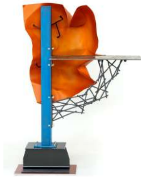
Joost van Bleiswijk, Collision , 2022, Courtesy of the Artists & Spazio Nobile