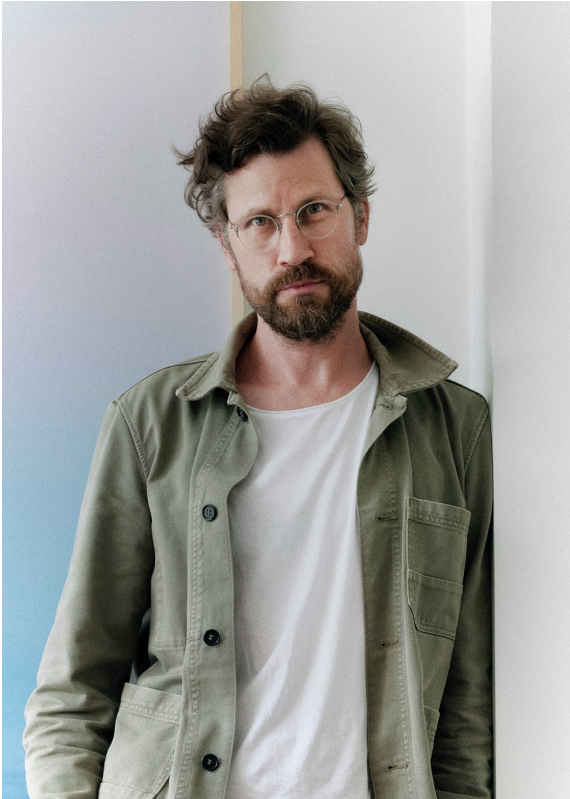
Frederik Vercruysse, Courtesy of the Artist & Spazio Nobile, © Frederik Vercruysse