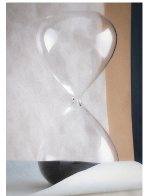
Frederik Vercruysse, Time is an Invention , 2017, Courtesy of the Artist & Spazio Nobile