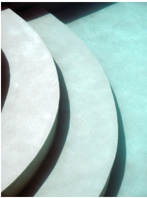
Frederik Vercruysse, Blue Stairs , 2017