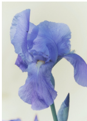
Frederik Vercruysse, A Spider And A Flower , 2024, Courtesy of the Artist & Spazio Nobile