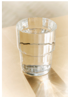
Frederik Vercruysse, Waiting for Lips , 2023, Courtesy of the Artist & Spazio Nobile