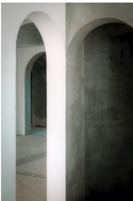
Frederik Vercruysse, Arches , 2022, Courtesy of the Artist & Spazio Nobile