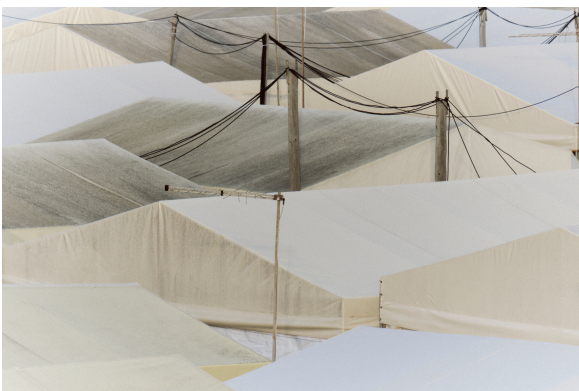
Frederik Vercruysse, Parque de Campismo , 2024, Courtesy of the Artist & Spazio Nobile