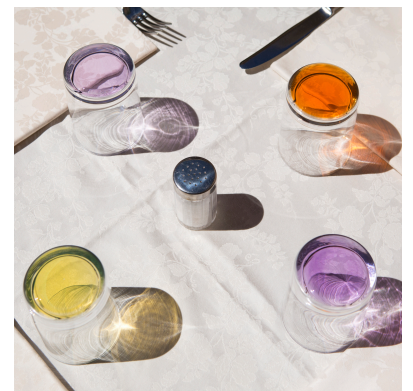
Frederik Vercruysse, Four Glasses and a Salt Shaker , 2014, Courtesy of the Artist & Spazio Nobile