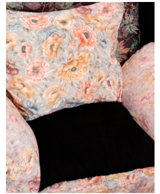
Frederik Vercruysse, Flower Seat , 2014, Courtesy of the Artist & Spazio Nobile