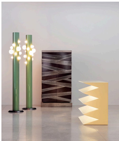
Lampadaire Electron N°589, 589, Spider Armoire N° 566, and Zappy Console Table, © Cecil Mathieu, courtesy of Hervé Van Der Straeten.