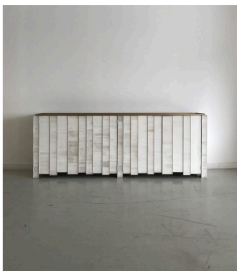
White Ice Cabinet by Jallu