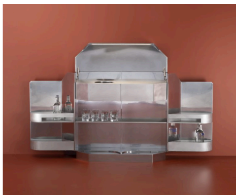
Barrha Bar by Yann Le Coadic, courtesy of Povenat.