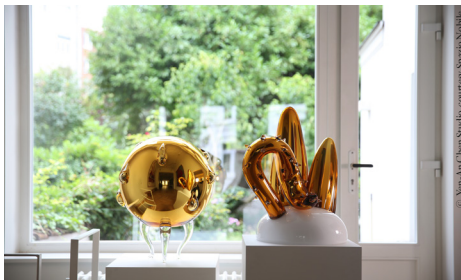
Laura Laine, exhibition view of Subtle Bodies at Spazio Nobile, Brussels